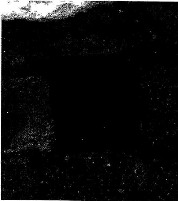
Catch basin before