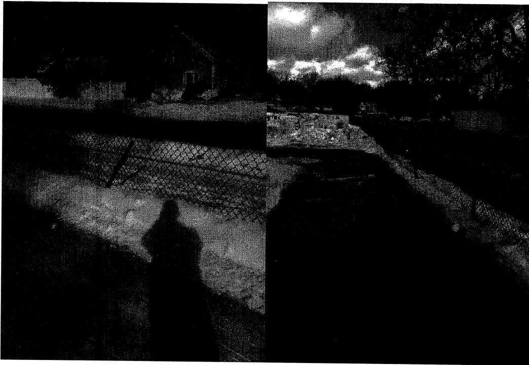
Before and after fence repair – Mt Elam side of Forest Hill

- Four trees removed as part of tree maintenance schedule